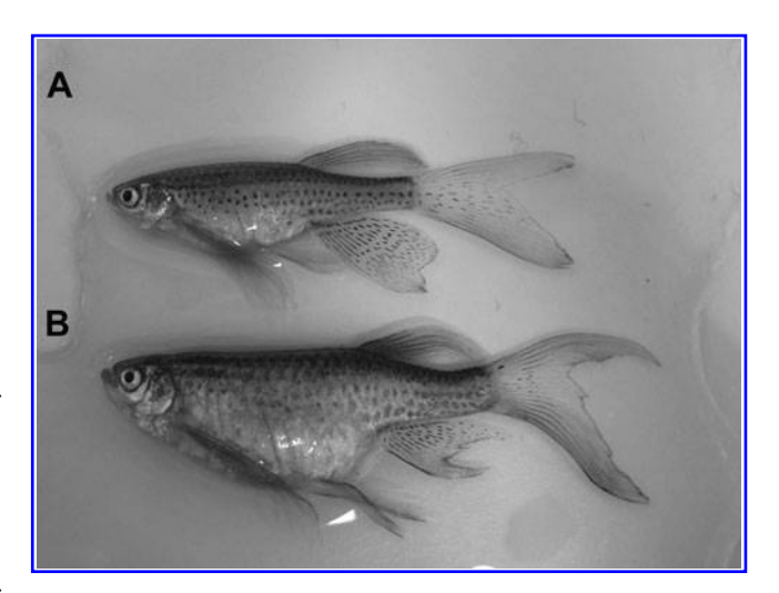
FIG. 1. Example of a descriptive annotation of a zebrafish welfare concern. (A) Normal appearance of zebrafish, (B) female with enlarged abdomen, which would be annotated as abdomen_general_distended .